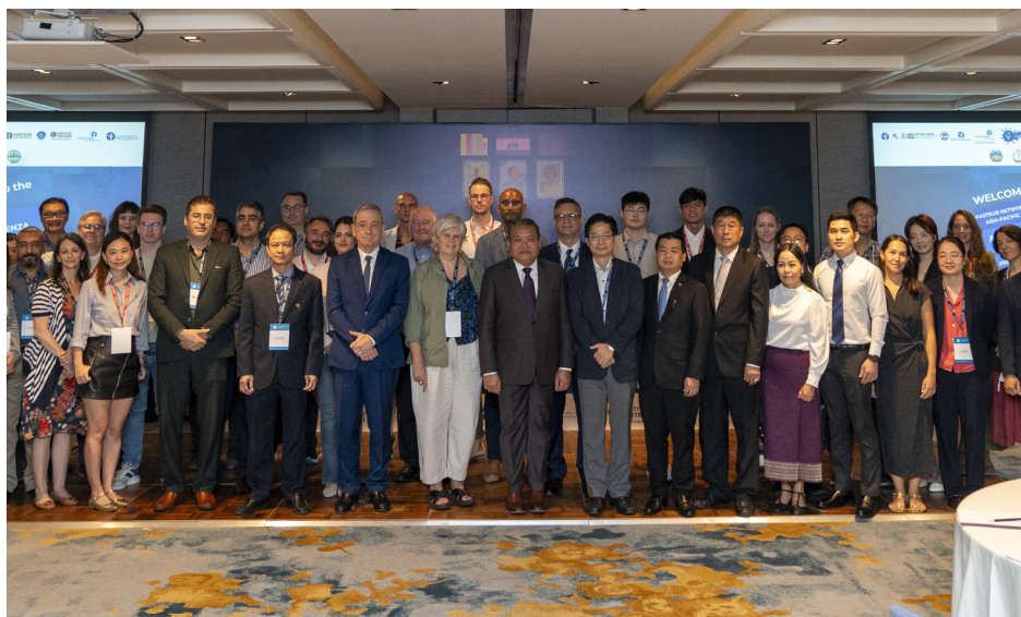
Leading scientists, public health experts, and policymakers gathered in Phnom Penh in December 2024 to address avian influenza in the Asia-Pacific region.

The Pasteur Network Asia-Pacific Avian Influenza Symposium was held in Phnom Penh, Cambodia, in December 2024. The event brought together leading scientists and public health experts from all nine Network institutes in the Asia-Pacific region, as well as key partners and policymakers, to address one of the most pressing zoonotic challenges of our time. Central to the symposium was the One Health approach, which integrates human, animal, and environmental health. Beyond presentations, the symposium also featured interactive workshops designed to foster collaboration and tackle critical challenges in influenza research and implementation. These workshops not only strengthened networks but also paved the way for actionable solutions to drive future progress. The event concluded with a unified vision for advancing influenza research and prevention. Participants emphasized that, while challenges remain, the partnerships formed and the knowledge exchanged during the symposium provide a strong foundation for addressing avian influenza at both regional and global scales.