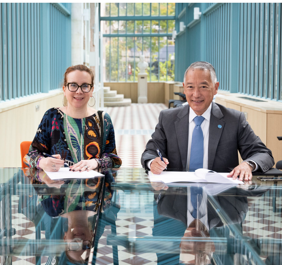
The International Vaccine Institute and the Pasteur Network signed a landmark Memorandum of Understanding in June 2024 to deepen collaboration on global health and infectious disease challenges.

A joint Steering Committee oversees the collaboration, regularly reviews progress, and ensures transparent communication, equity, sustainability, and adherence to anti-fraud and anti-corruption policies. This Memorandum of Understanding represents a strategic alignment of resources and capabilities to generate impactful solutions to global health challenges, drive innovation, and improve public health outcomes worldwide.