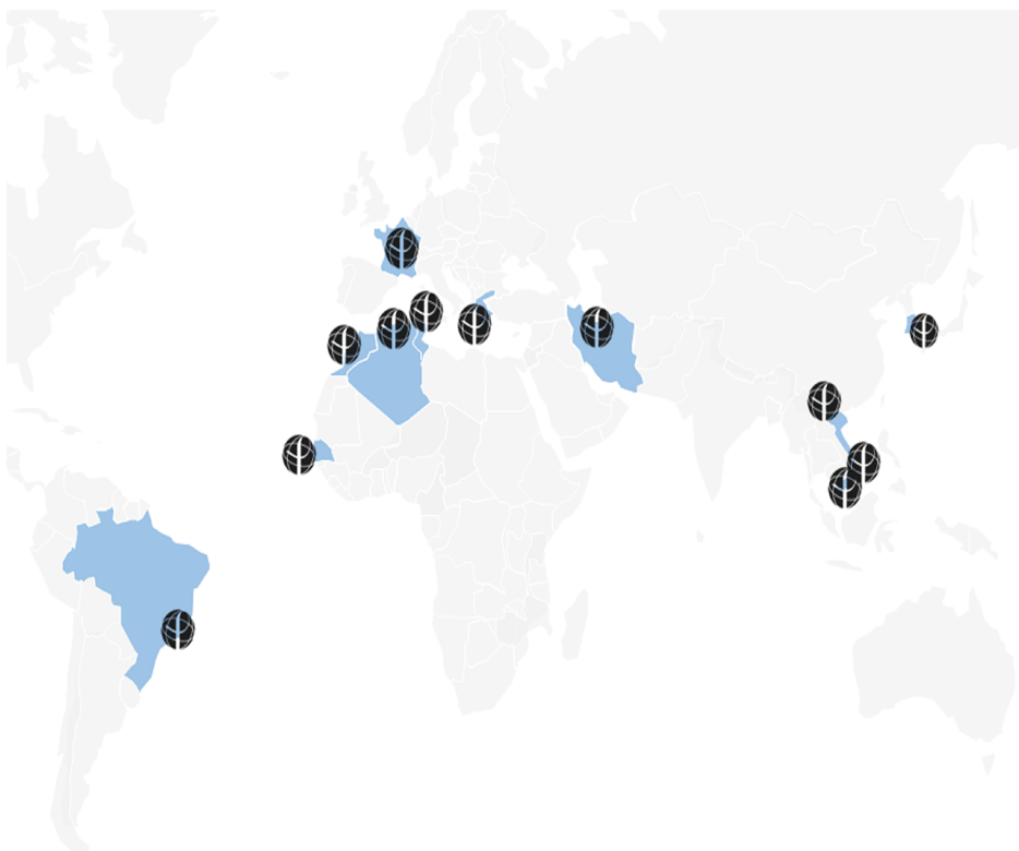
Location of Pasteur Network Vaccine Manufacturing Initiative members

CREATING AN INTERCONNECTED, SUSTAINABLE ECOSYSTEM FOR VACCINE DEVELOPMENT, PRODUCTION, AND EQUITABLE DISTRIBUTION