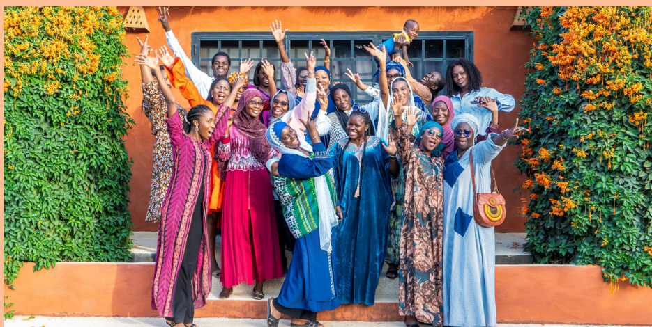
Participants of the Women and Scientific Careers Program.

aims to increase women’s representation in STEM fields and leadership positions while improving working conditions and career progression. In its first year, the initiative reached over 180 beneficiaries, trained 150 collaborators in emotional intelligence, mental health, and menstrual health, and supported career development, leadership training, and work-life balance for women across the institute. Concrete, transformative measures include expanded access to continuing education, support for young women researchers, and family-friendly infrastructure, such as a daycare system and pumping rooms. A growing mentoring and youth ambassador program further extends its impact to schools and universities, reaching hundreds of students—two-thirds of them girls—and reinforcing scientific aspirations from an early age.